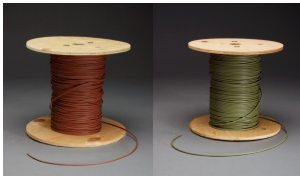
SC-3 sensor cable (left) and SC-4 sensor cable (right)

When connected to a Fiber SenSys Alarm Processing Unit (APU), SC-3 and SC-4 sensor cables detect potential intruders through the use of fiber-optic technology that senses cable movement, interference, or tampering. These proprietary cables are designed to monitor the optical signal properties and detect the effects of movement, vibration and pressure. Together with an APU, these sensor cables form complete intrusion detection systems. The sensor cables are immune to EMI, magnetic fields, radio frequency transmissions and lightning. Rugged, durable construction ensures the cable survives exposure to the elements and weather conditions making them ideal for harsh environments.